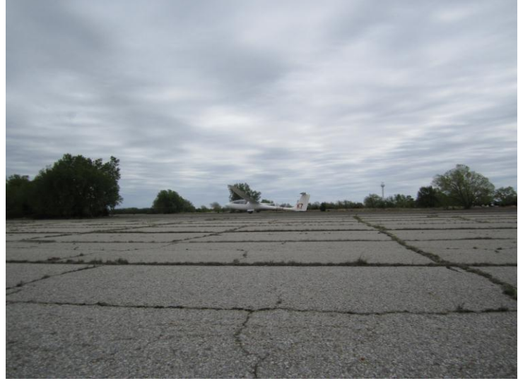
Jerry flew three times in the Zuni!