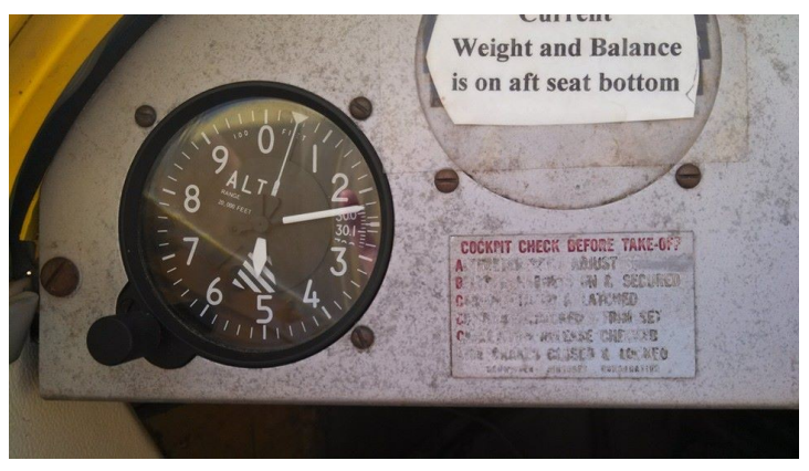
2-33 over 5,200 MSL