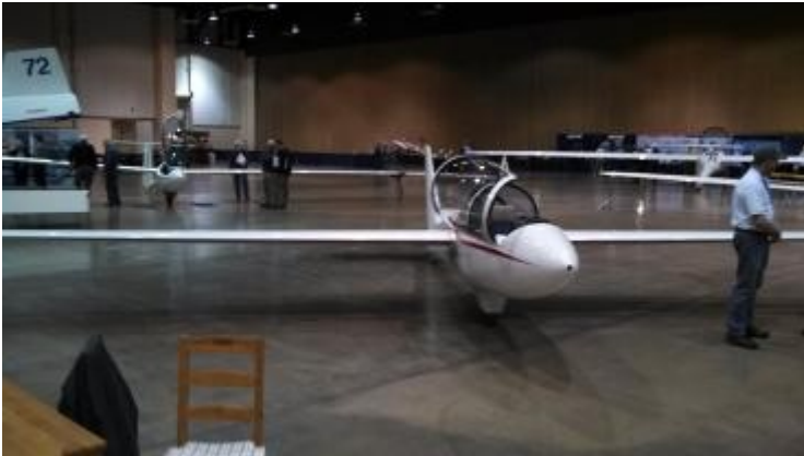
MDM Fox for the Aerobatically inclined