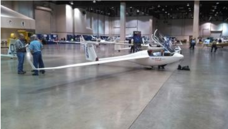
Silent 2 Electro