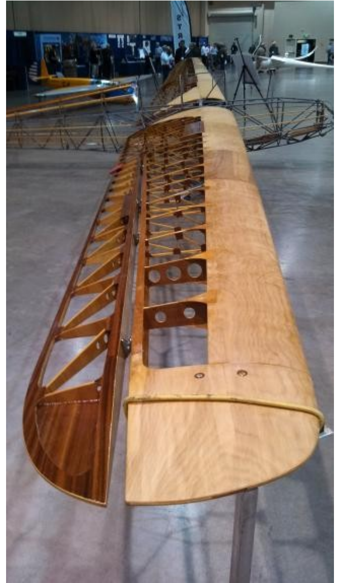
LK-10, uncovered. Beauty!