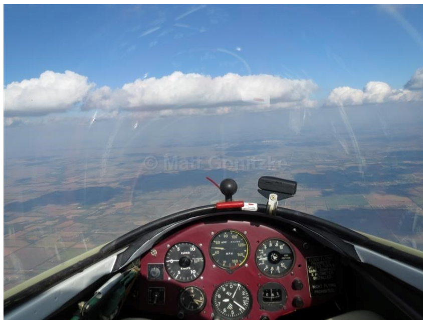
The sky was a glider pilot's dream. Heading towards El Dorado.

According to the weather forecast, Sunday the 28 th appeared to be the best day of all for the VSA regatta. Most of the out-of-town folks had left, but us locals and the others left flew. The weather looked better to the east, which is odd for this location, so I decided to launch early and fly Wichita Gliderport-El Dorado-Augusta-Wichita Gliderport twice, and try to get the hardest part of the silver badge, the 5-hour duration flight, in the process. In order to maximize my available soaring time, I launched at noon and released from the towplane at 12:05. Staying up was initially quite a struggle. It was quite early in the day, the cu had only just begun to form, and lift was weak. I stuck well enough that several other gliders launched, and this made finding the thermals easier. By 1pm or so the cu had filled in as far as the eye could see, so I headed for El Dorado.