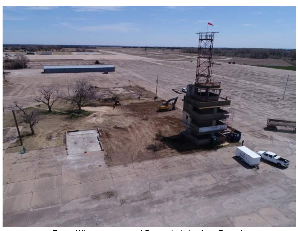
Tower Wings are no more! Drone photo by Jerry Boone !