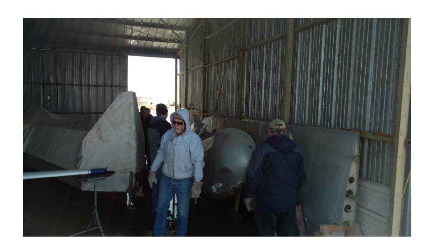
Spring Work Day Scenes